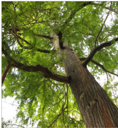
Upward view of the trunk and branch structure of the Bald Cypress.