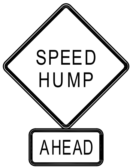
ADVANCED WARNING SIGN W17-1 AND W16-9P