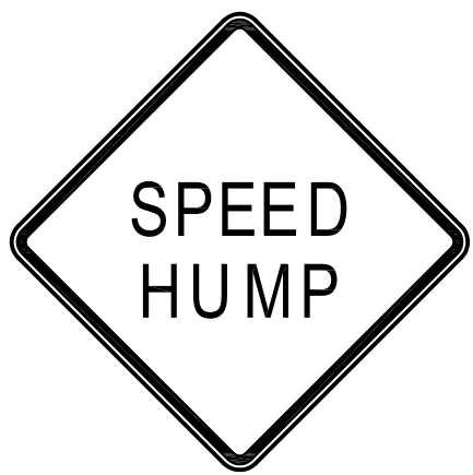
SIGN ADJACENT TO SPEED LUMP W17-1