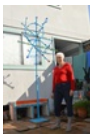
Color molecule 1. Steel and glass 10' x 6' x 2' $13000.00 2012