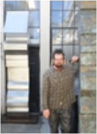
Prime Mover Stainless Steel 121" x 24" x 24" $30000.00 2010