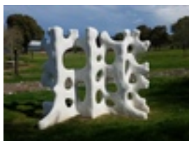
Opus Composite materials, GFRC 8' x 10.5' x 3.5' $55000.00 2013