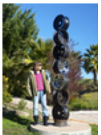
ROLLIN' UP, with artist for scale steel 10' x 17" x 17" $9000.00 2019