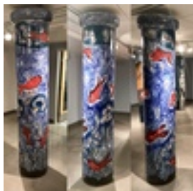
Aquarium clay and paint 93" x 24" x 24" $20000.00 2017