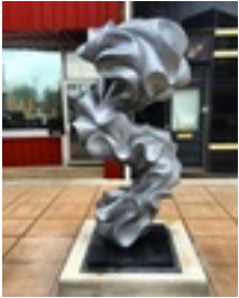
Depth of Form Cold-cast aluminum 90" x 36" x 45" $15000.00 2015