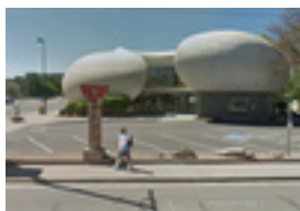
Shared Eye (with pedestrian) Concrete, painted steel 144" x 48" x 48" $25000.00 2010