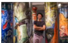
Ceramic Pipes clay and paint 93" x 24" x 24" $20000.00 2016