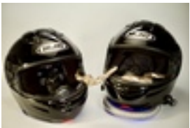
leaving eden kevlar, fiberglass, plastic, foam, bronze, light 11" x 36" x 10" $900.00 2018