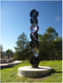
ROLLIN' UP, front (back about the same) steel 10' x 17" x 17" $9000.00 2019