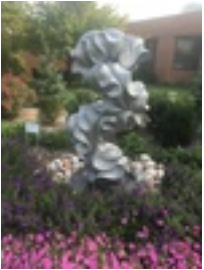
Depth of Form Cold-cast aluminum 90" x 36" x 45" $15000.00 2015