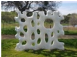
Opus Composite materials, GFRC 8' x 10.5' x 3.5' $55000.00 2013