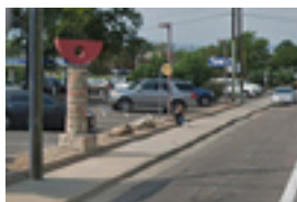
Shared Eye (with person sitting nearby) Concrete, painted steel 144" x 48" x 48" $25000.00 2010