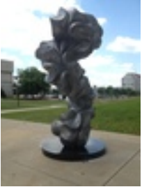
Depth of Form Cold-cast aluminum 90" x 36" x 45" $15000.00 2015