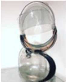
born to be wild plexiglass, plastic, metal 19" x 16" x 10.5" $1000.00 2017