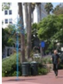
color molecule 1 steel and glass 13' x 4' x 4' $15000.00 2008