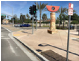
Shared Eye (placed on site) Concrete, painted steel 144" x 48" x 48" $25000.00 2010