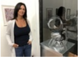
born to be wild plexiglass and steel 6' x 2.5' x 2.5' $3500.00 2017