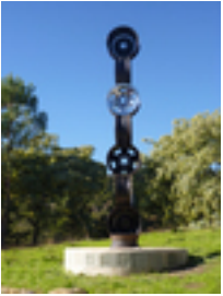
ROLLIN' UP, side view steel 10' x 17" x 17" $9000.00 2019