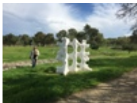
Opus Composite materials, GFRC 8' x 10.5' x 3.5' $55000.00 2013