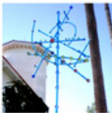
Color molecules steel and glass 14' x 6' x 2' $15000.00 08